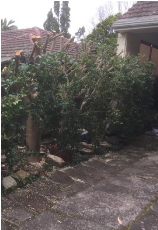
Towards the Carport