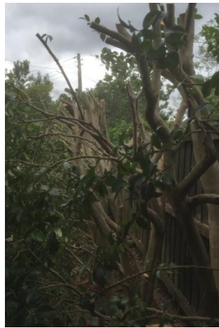
Initially 300mm Above, But Then Down to the Top of the Fence