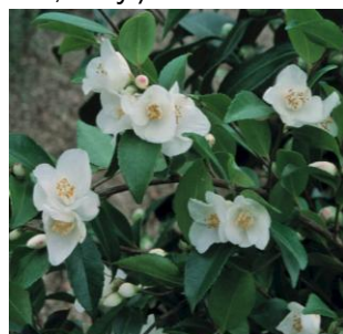
Camellia lutchuensis —Perfumed