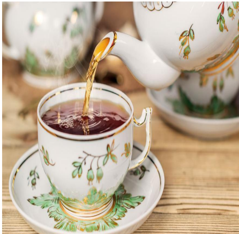
A Refreshing Brew of Camellia Leaves