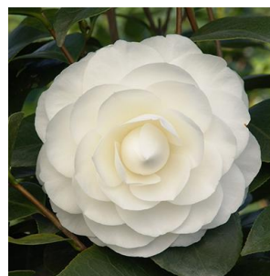
C. Japonica 'Monrovia'