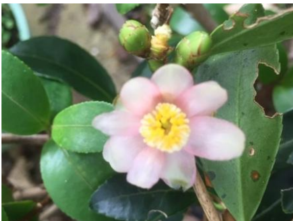
The plant looked as if it would be a good subject for bonsai and now we can see the beautiful miniature flowers and leaves of C. puniceiflora