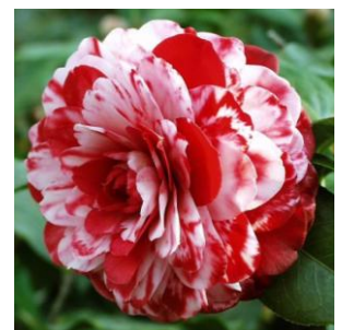
C. Japonica 'Tudor Baby Variegated'