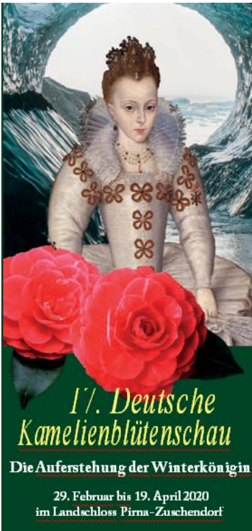
17 th German Camellia Flower Show

The camellia shows in Pirna-Zusendorf are divided into: February 29 to April 19, 2020 Tue to Sun and public holidays 10:00 a.m. to 5:00 p.m. Botanical Collection of the TU Dresden Landschloss Pirna-Zusendorf Opening of the show houses with Seidel's camellia collection 17th German Camellia Flower Show at the Pirna-Zusendorf Castle (together with the Central German Camellia Society)