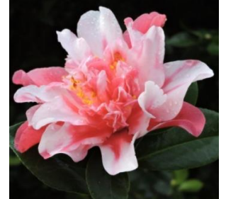
Mark Alan Variegated