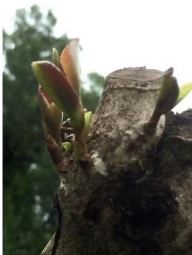
Within a Fortnight Epicormic Buds Appeared